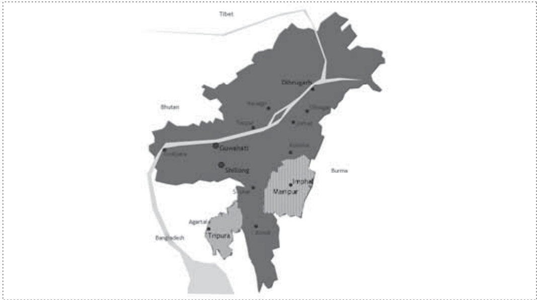
Figure 1: Assam at the time of independence showing the then neighbouring states of Tripura and Manipur